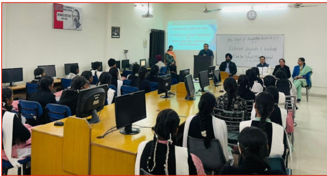
EDUCATIONAL VISIT FROM STUDENTS OF GOVT. SEN. SEC. SCHOOL ,KALA AFGANA UNDER NSQF