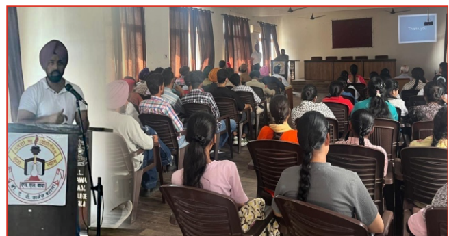
Lecture on Stress Management