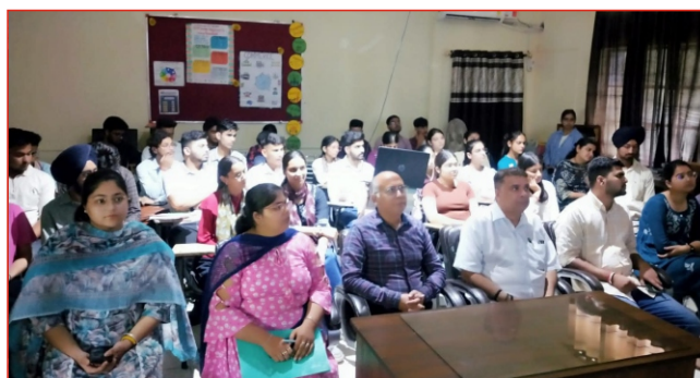
A Dynamic & Thought-provoking Session titled "Converting Innovation into Startups"