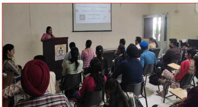
A student showcasing her Oratory Skills in Declamation Contest