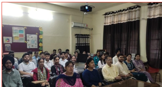
Building the future through innovation, Collaboration and learning- IIC Program highlights