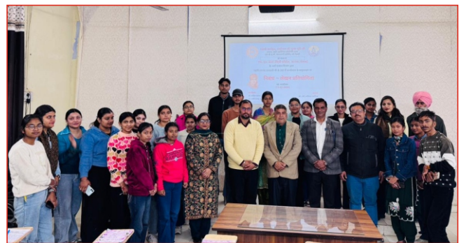
स्वामी दयानन्द सरस्वती जी की जयंती पर "निबन्ध लेखन प्रतियोगिता" का आयोजन