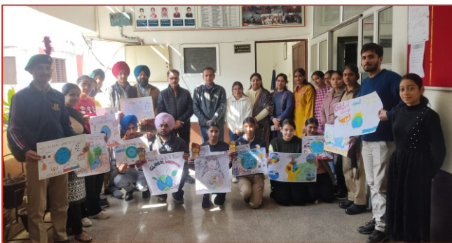
POSTER MAKING COMPETITION ON THE TOPIC GLOBAL WARMING