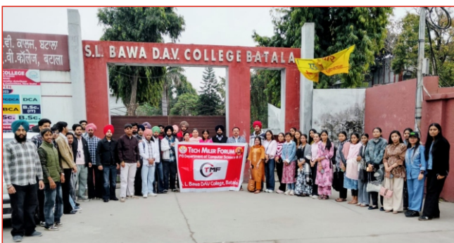
One day Trip "Mata Chintpurni Temple" and "Bombay Picnic Spot"