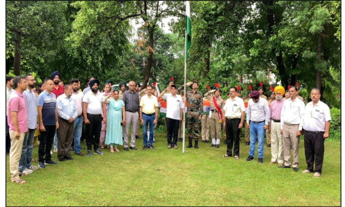
Independence day Celebration Year 2025