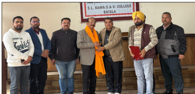
Inauguration of 7 Days NSS Camp

The main aim of NSS activities is to build sense of participation among students towards social work. NSS volunteers give their services in villages, slums and Local NGOs. These activities help in propagation of message of health, education, hygiene among the local community.