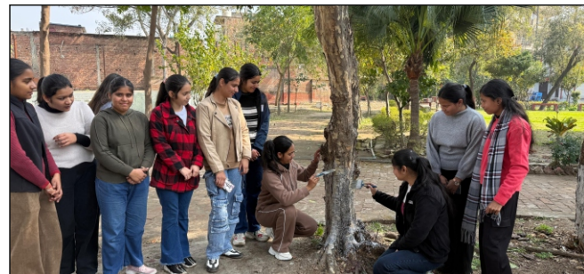
Maintaining the Plants in College Campus