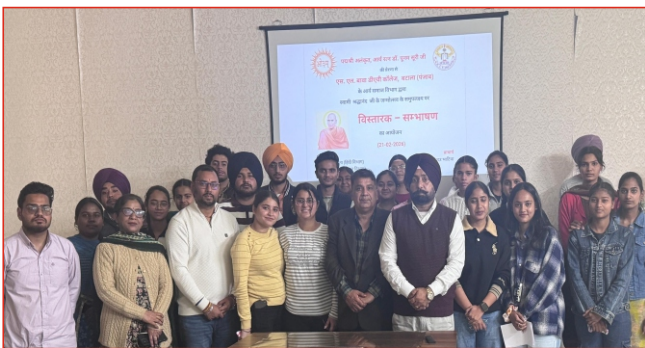
स्वामी श्रद्धानन्द जी की जयंती पर "विस्तारक सम्भाषण" का आयोजन