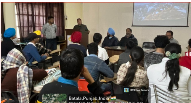
Celebrating Sant Guru Ravidas Jayanti