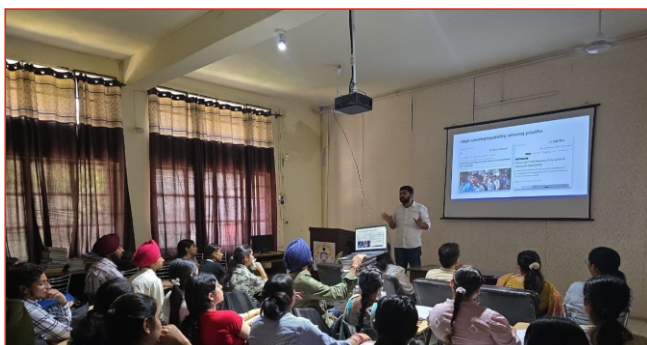
Empowering Youth to turn ideas into successful startups