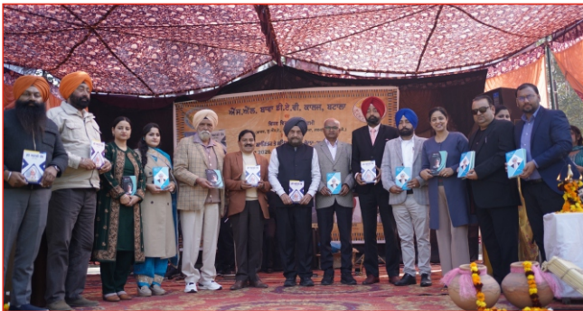
Celebrating Sahitak & Sabhyacharak Mela

Faculty of Arts is continuously looking for overall development of students by organising various activities like educational trips, celebrating days of national importance etc. .