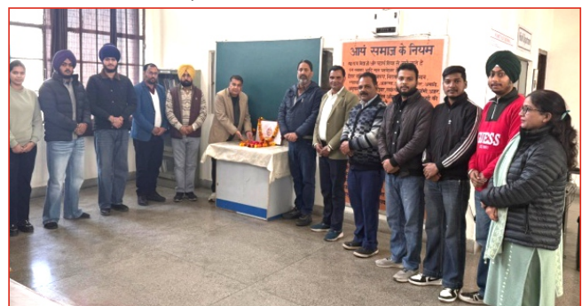
"पंजाब-केसरी" लाला लाजपत राय जी की जयंती श्रद्धापूर्वक मनाई