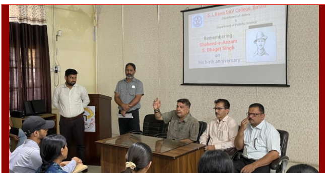
Remembering Shaheed-e-Azam S. Bhagat Singh Ji on his birth anniversary