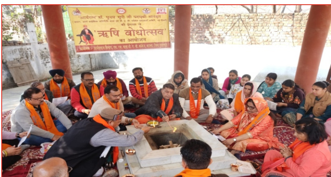
ऋषि - बोधोत्सव के उपलक्ष्य पर वैदिक हवन यज्ञ