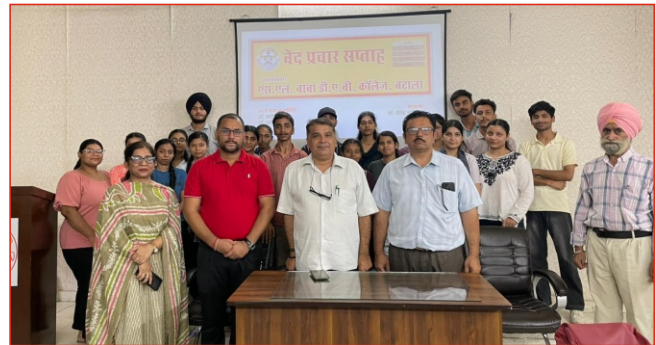
वेद प्रचार सप्ताह के अंतर्गत "वेदों का महत्व" विषयाधारित संगोष्ठी