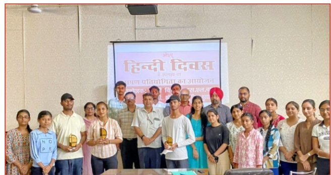
Speech Competition on Hindi Diwas