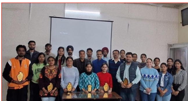
Participants and winners of "Budget Pe Charcha - A Vision for Viksit Bharat."