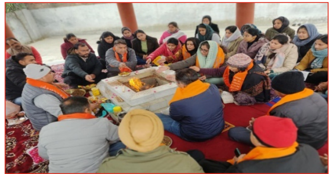
मध्य-सत्रारम्भ के उपलक्ष्य पर वैदिक हवन यज्ञ