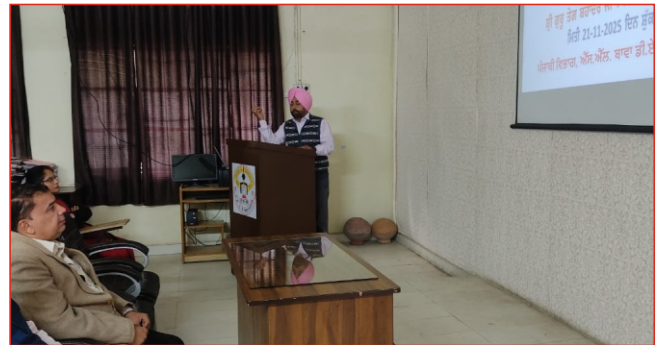
Seminar on 350 th Shaheedi Diwas of Shri Guru Teg Bahdur Ji