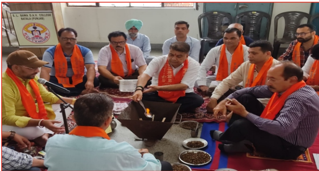
नव-सत्र शुभारम्भ के उपलक्ष्य पर वैदिक हवन यज्ञ

Various Arya Samaj Activities are organized in the college to inbuild moral values and ethics in the students.