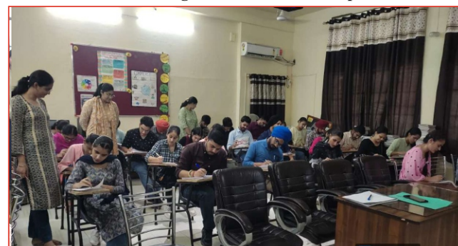
Participants solving the Questionnaire during the commerce Quiz