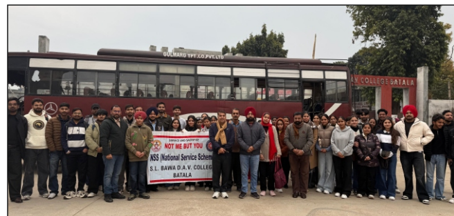
Visit to Mukteshwar Dham (Pathankot)