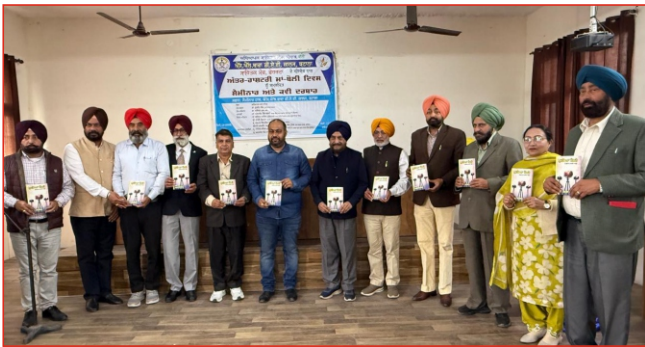
Celebrating International Maa-Boli Diwas