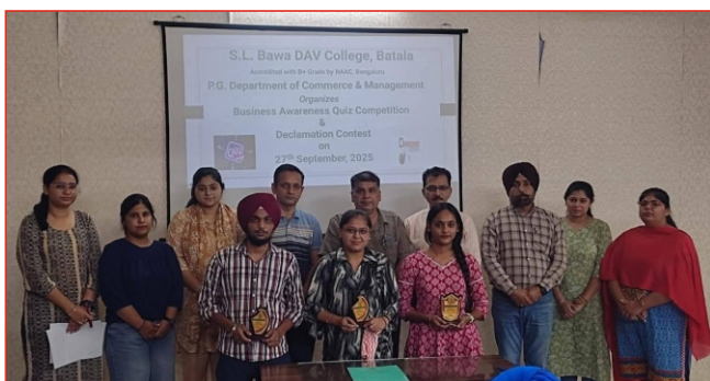
Students honoured for outstanding performance in Business Awareness Quiz and declamation Contest