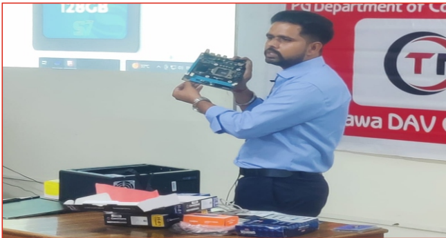
WORKSHOP ON COMPUTER HARDWARE ASSEMBLING, TROUBLESHOOTING AND OS INSTALLATION

IT professionals are in great demand for the job roles such as Technical Analyst, Data Scientist, Web Developer, Software Developer, Banking Sector etc. PG Department of Computer Science & IT always encourages and motivates students to participate in various technical activities.