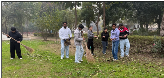
Cleanliness Drive in College Campus