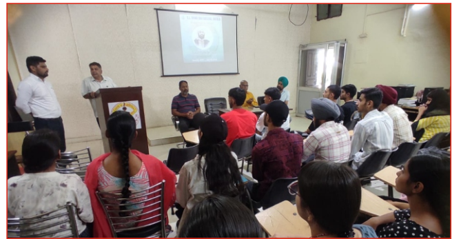
Remembering Shaheed Udhan Singh Ji