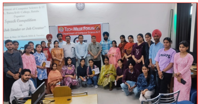
SPEECH COMPETITION ON AI: JOB STEALER OR JOB CREATOR